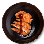
Katsu Bites £6.25