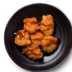
Vegan Chicken Bites £6.99