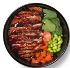
Chicken Teriyaki £7.50