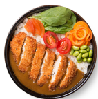
Chicken Katsu Curry £7.50