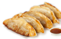
Chicken Dumplings £5

Sauce Options: Mayonnaise or Sweet Chilli